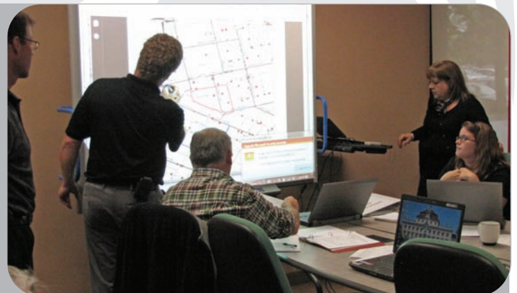
Representatives from Egg Farmers of Ontario, Turkey Farmers of Ontario and Ontario Broiler Hatching Egg & Chick Commission gathered at the CFO office for the duration of the simulation; testing their Operations and Communications skills

Members of the FBCC met on September 8th to participate in a disease simulation that allowed them to conduct further testing of their emergency plans within an Incident Management System. This simulation used information provided to the FBCC through Ontario Pork, who conducted their own disease simulation on September 7th. The focus of the FBCC efforts were around improvements