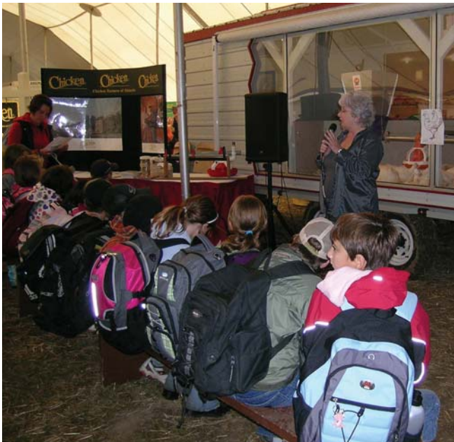
International Plowing Match in Teeswater, Ontario

From the feedback and questions we get on the road, it's clear consumers are increasingly interested in understanding how chicken farmers ensure a safe, quality product. Specifically, questions on biosecurity and automated feeding seem to be on the rise.■